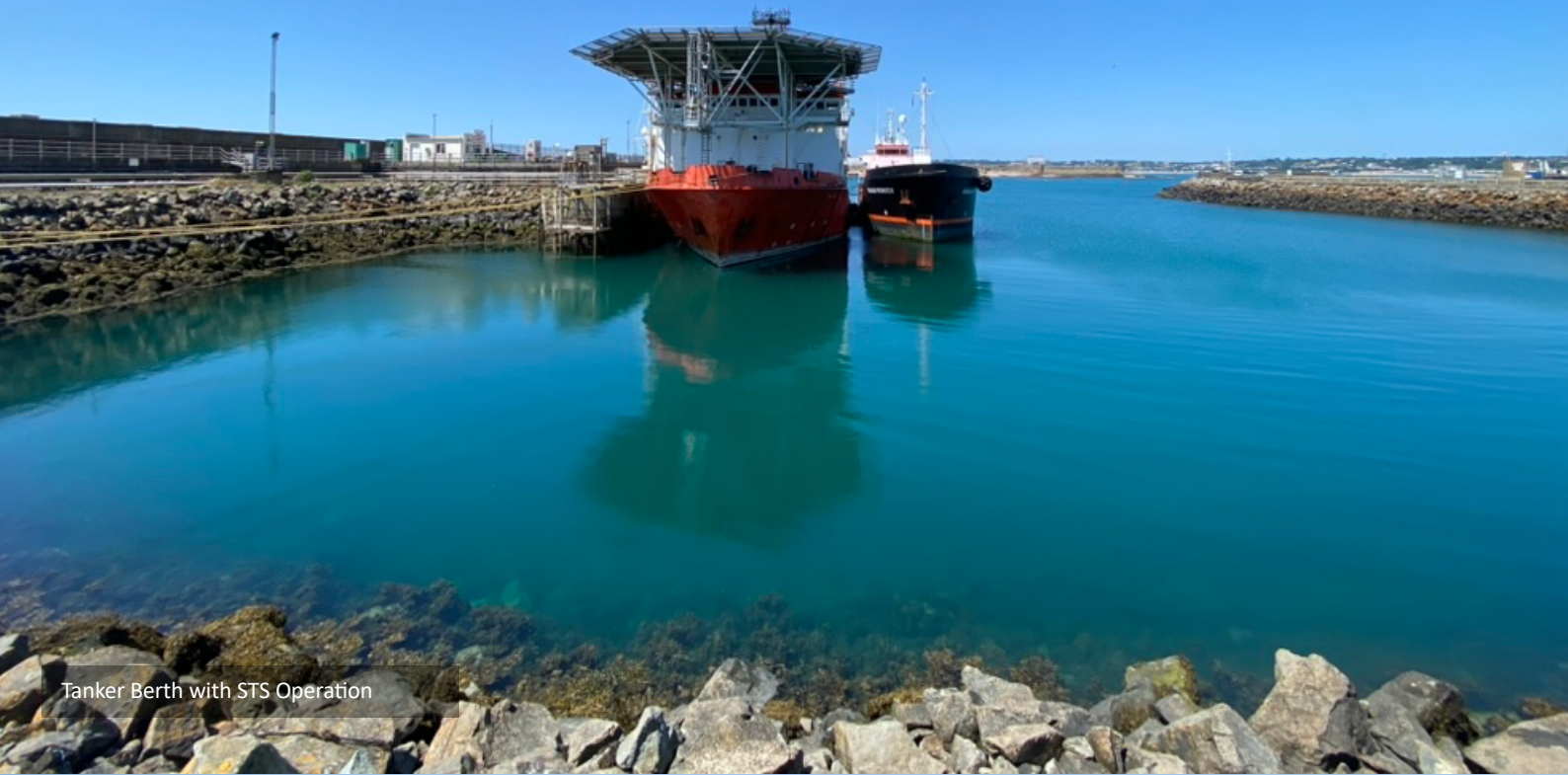
Tanker Berth with STS Operation