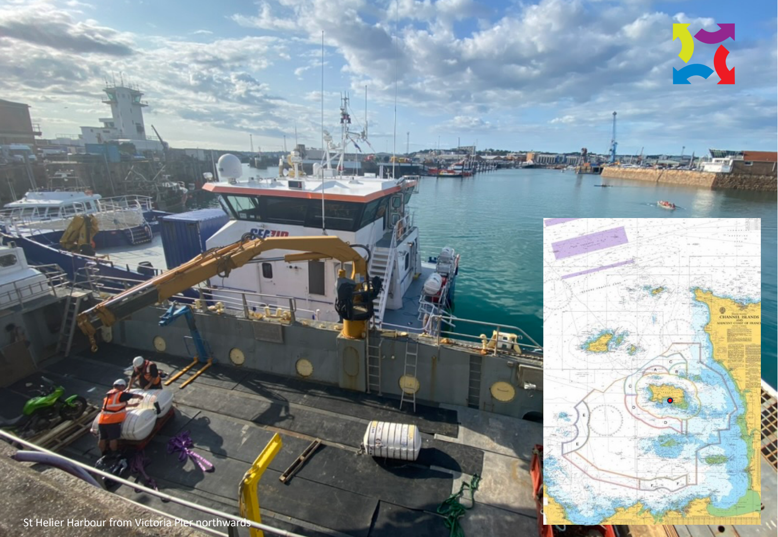
St Helier Harbour from Victoria Pier northwards