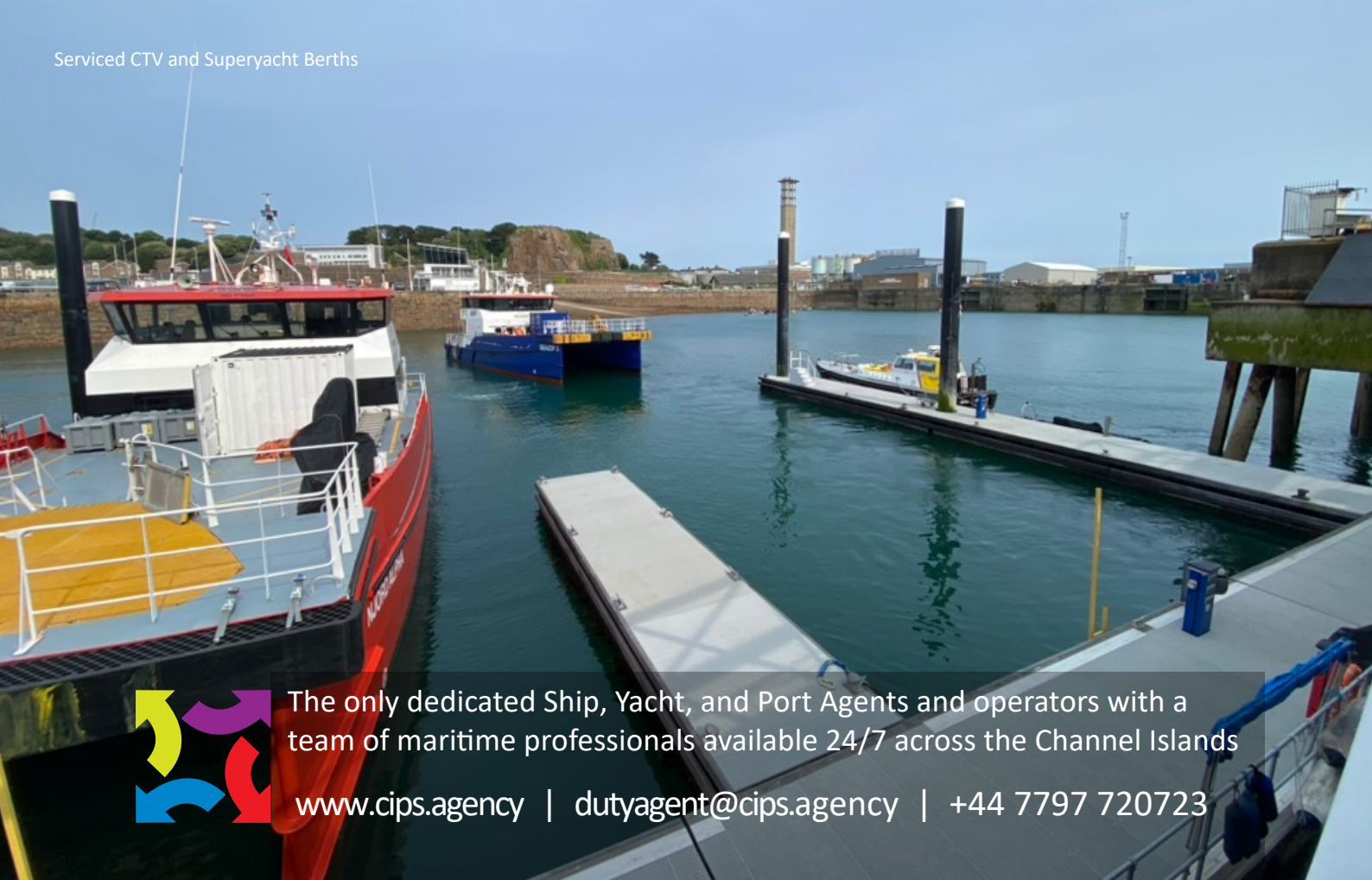
Serviced CTV and Superyacht Berths